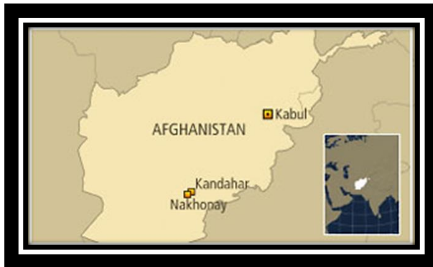
Figure 1: Nakhonay